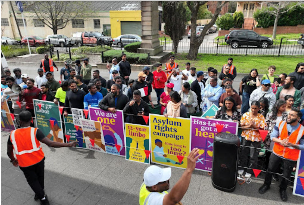
Sydney 24/7 Protest for Permanent Visas - now more than 100 days

Refugees in Sydney continue their 24/7 protest. You can send a message of support - record a brief clip on your phone and share on to the FB page: 24 Hour Continuous Protest For Permanent Visa facebook.com (Sydney Protest) or send to Kalyani Inpakumar on WhatsApp.