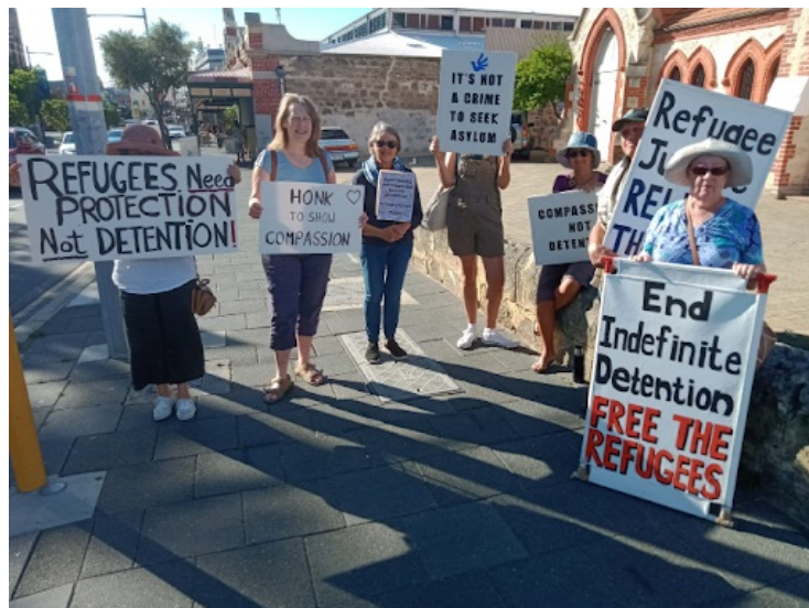
Action in Freemantle WA

PERMANENT PROTECTION - Sign the petition and follow and support the campaign here: https://www.facebook.com/iranianwomensassociation/