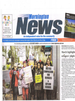
19 July - Mornington Peninsula Human Rights Group did a day time action at the market, and handed out flyers..... and got coverage in their local paper

In this section we plan to profile two or three stories each month (short paragraph with a pic)...So please send through any pictures with a brief caption/explanation to share in the next newsletter - please note that all 'news items' from member groups will be posted on the ARAN website even if they don't make it into the Newsletter because of space limitations.