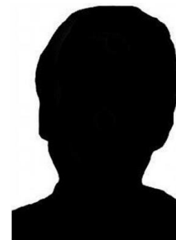
Rohingyan refugee, 52 died on May 22 2018 on Manus Island