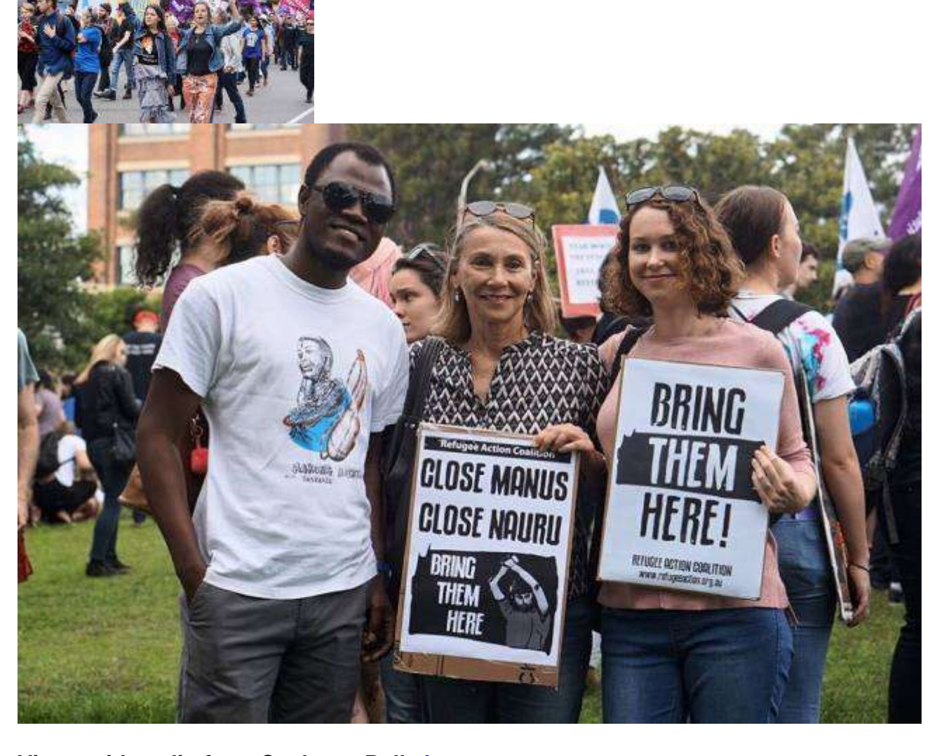
View a video clip from Canberra Rally <u>here</u>.